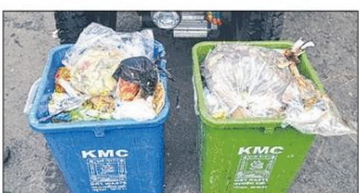
Plastic bags of garbage thrown into CMC's green bin, meant for biodegradable waste, at a collection centre on the Rashbehari connector last week. Residents are to empty out the contents of plastic bags containing biodegradable waste, like kitchen waste, into the green bins and then throw the plastic bags into blue bins, meant for non-biodegradable waste, said a CMC official.

Morning waste collectors of the CMC, too, have green and blue bins of larger sizes in their carts. Residents are supposed to throw the waste into the green bins in their homes into the green bins in the carts and blue bin waste in the blue ones.