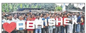
Trinamul supporters welcome party leader Abhishek Banerjee at Harinapuram in South Dinajpur, on Tuesday.

Abhishek also accused the Centre of increasing the price of common people (in Bengali) by asking the Centre to withhold funds for social welfare schemes..."